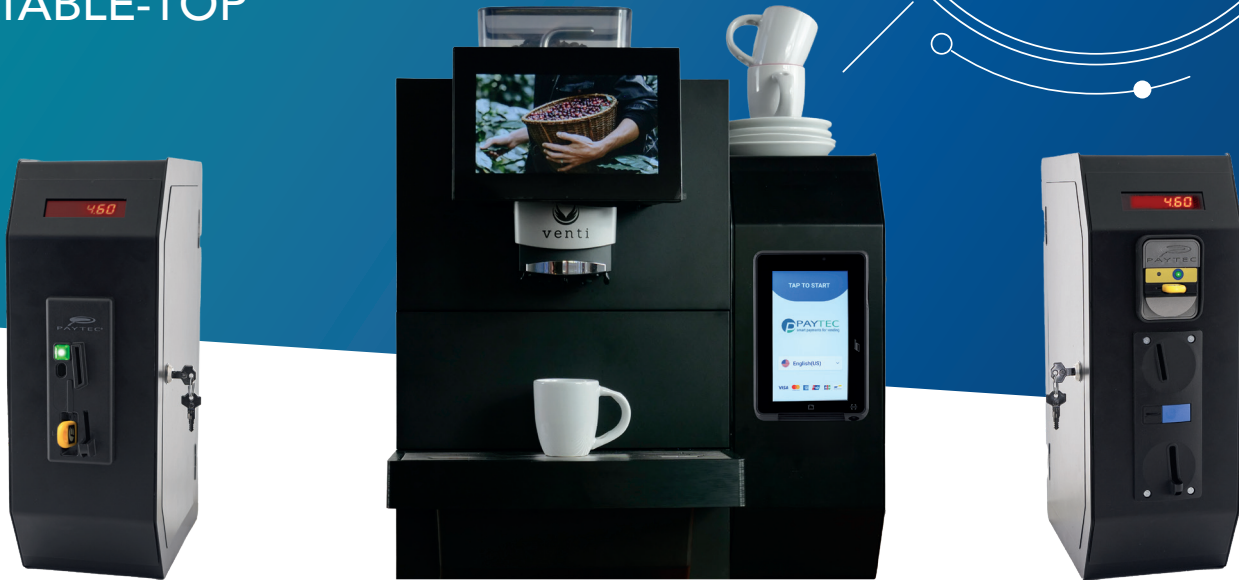
PayBox - GIODY